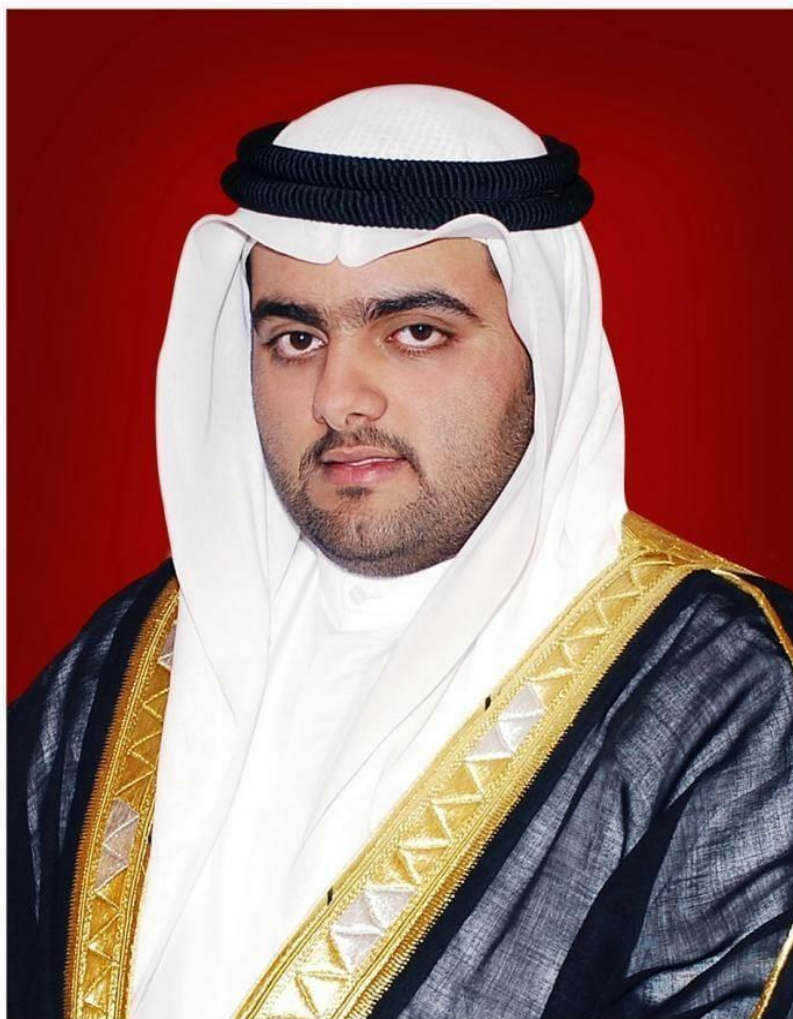
شؤون الشيخ محمد بن محمد بن محمد الشرف ولي عهد إمارة الفجيرة