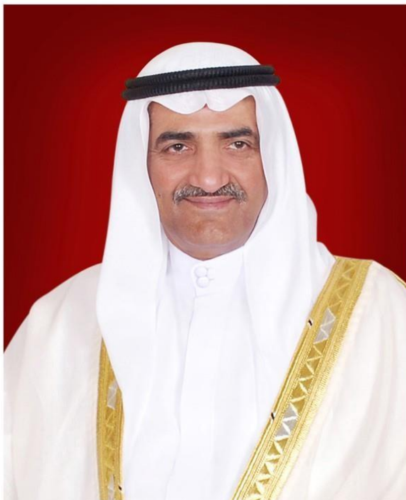
صاحب السمو الشيخ محمد بن محمد الشرف عضو المجلس الأعلى حاكم الفجيرة